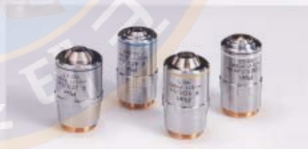
OBJECTIVES FOR FLUORESCENT MICROSCOPY