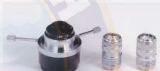
DARKFIELD CONDENSER AND OBJECTIVES WITH IRIS DIAPHRAGM