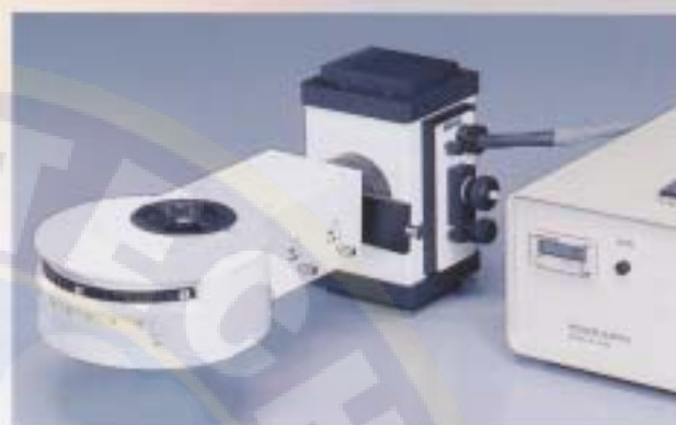
MX-EPI-2 EPI FLUORESCENT ATTACHMENT SET