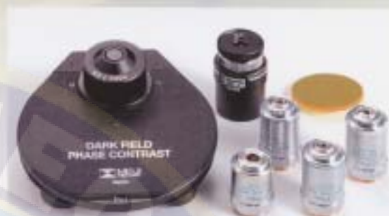
ZERNIKE PHASE CONTRAST SET