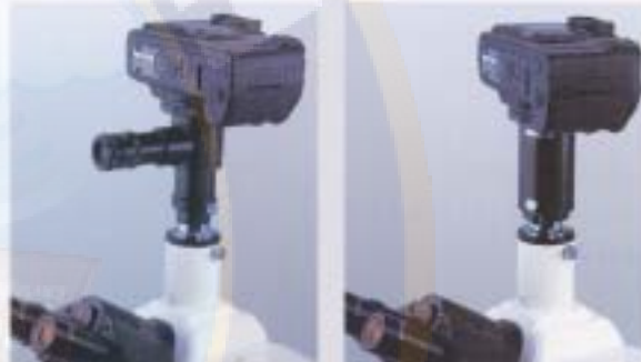
MA150/60 Camera attachment MA150/50 Camera attachment

These attachments are used to mount the camera with T2 adapter ring to the photo tube.